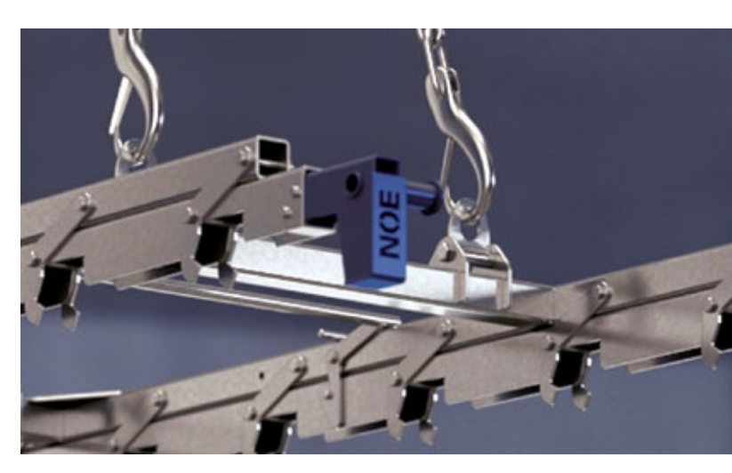
We reserve the right to make technical modifications. 2022-12

Kuntzestr. 72, 73079 Süssen T + 49 7162 13-1 info@noe.de www.noe.eu